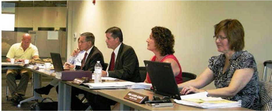
Village Board Members at work on July 14, 2015

Village Hall is undergoing some minor renovations this month, and our Engineering Firm, Gewalt Hamilton and Associates, was kind enough to host the July 14th Village Board meeting. One major piece of business we accomplished was the approval of an engineering proposal from GHA for the design of the extension of our village public water system. Currently, the village-owned deep well near Sunset Foods only serves the businesses in Sunset Grove Plaza, and the meeting's action set into motion the ability for that system to serve the entire historic downtown. Work is also progressing towards a connection to Lake Michigan water through the Northwest Water Commission, which will have the capacity to be delivered through this downtown water main loop. Expansion of our municipal water system is key to opening the flow of economic development in our downtown, and the Village is working hard to enable several new opportunities to develop.